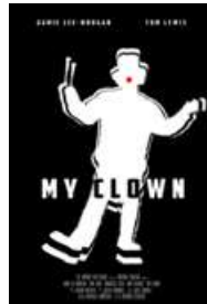
My Clown (2018) Short