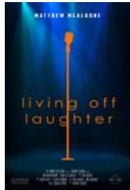
Living Off Laughter (2018) Documentary