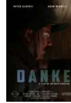
Danke (2018) - Short