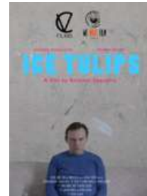
Ice Tulips (2017) Short