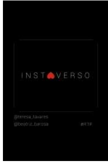
Instaverse (2020) - TV Series

Previous projects include amongst others: