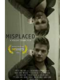
Misplaced (2016) Short